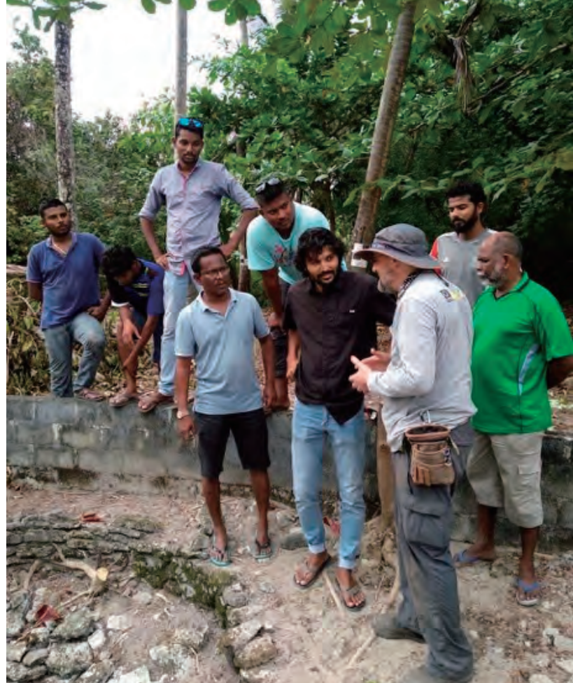
Explaining our work to neighbours in Kaashidhoo