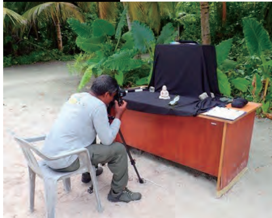
Field photography of a Buddhist statue recovered in Isdhoo Kalaidhoo