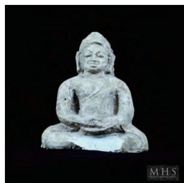
Seated Buddha statue recovered by the MHS at Isdhoo Kalaidhoo, now in the collections of the Maldives National Museum (c. 10th-11th century)