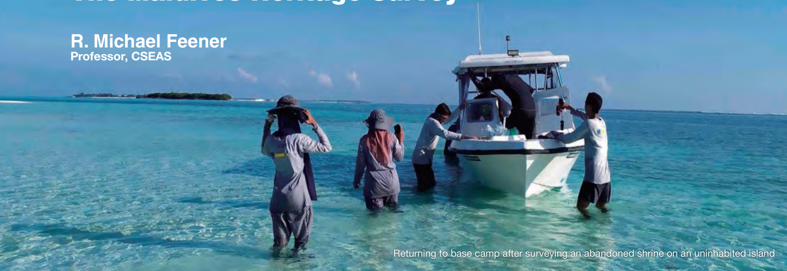
Returning to base camp after surveying an abandoned shrine on an uninhabited island

The Maldives is a remote Indian Ocean archipelago of coral atolls comprising 1,192 islands, of which fewer than 200 are currently inhabited. Buddhism had spread to the islands during the first millennium CE, but was completely displaced by processes of Islamization that began in the twelfth century with abrupt political and economic transformations as institutional Buddhism was abolished and mosques built on royal commissions across a number of islands. Over the centuries that followed, integration into trans-regional circulations of commerce and culture facilitated the development of distinctive forms of Muslim vernacular culture including the country's traditional coral stone mosques, funerary monuments, and Dhivehi-language literature. Despite its long history and rich heritage, the Maldives has been so little studied that even in major research university library holdings have precious few sources available for the exploration of the country's history.